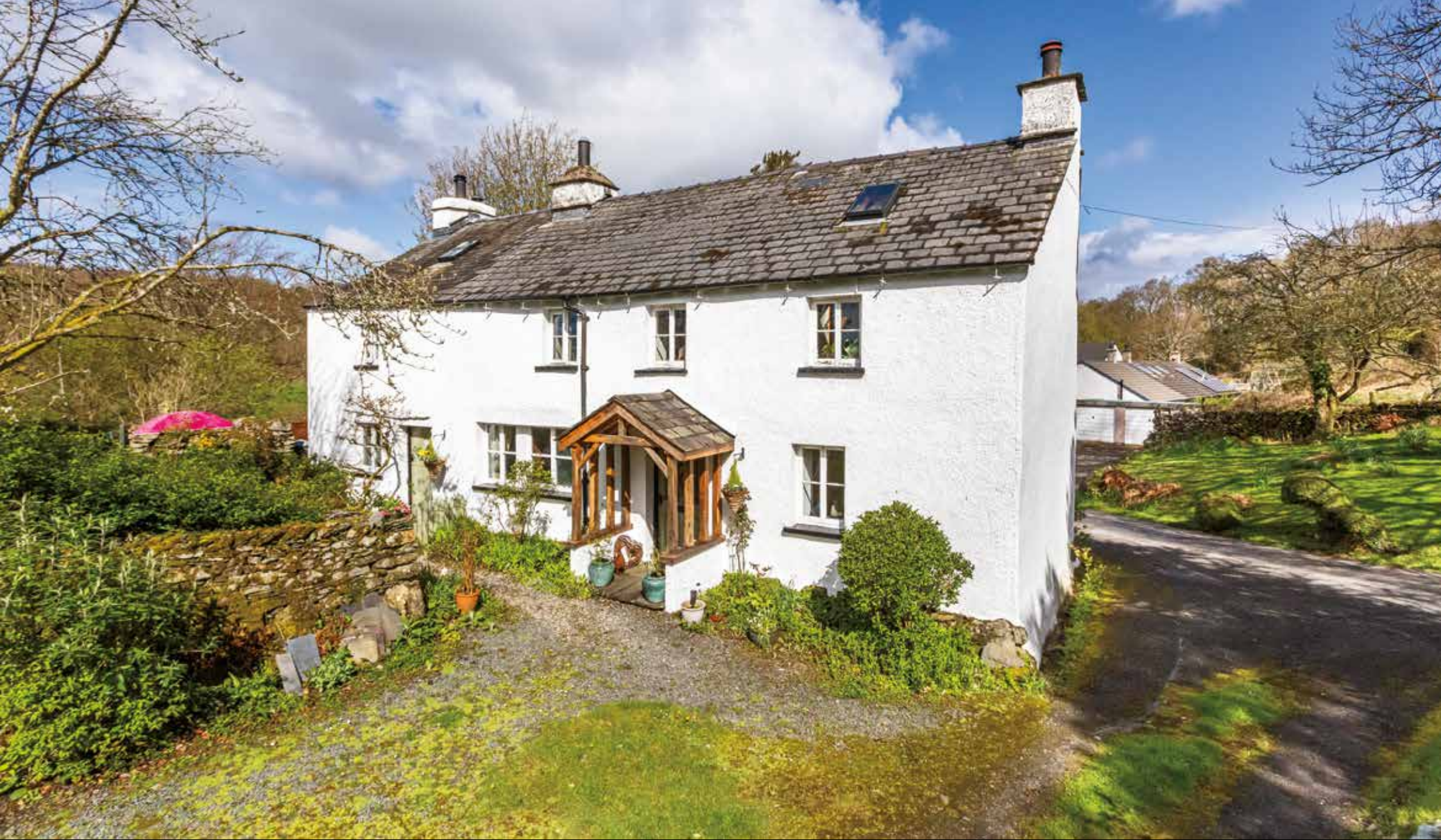
Cragg House Bouth | Cumbria | LA12 8JQ