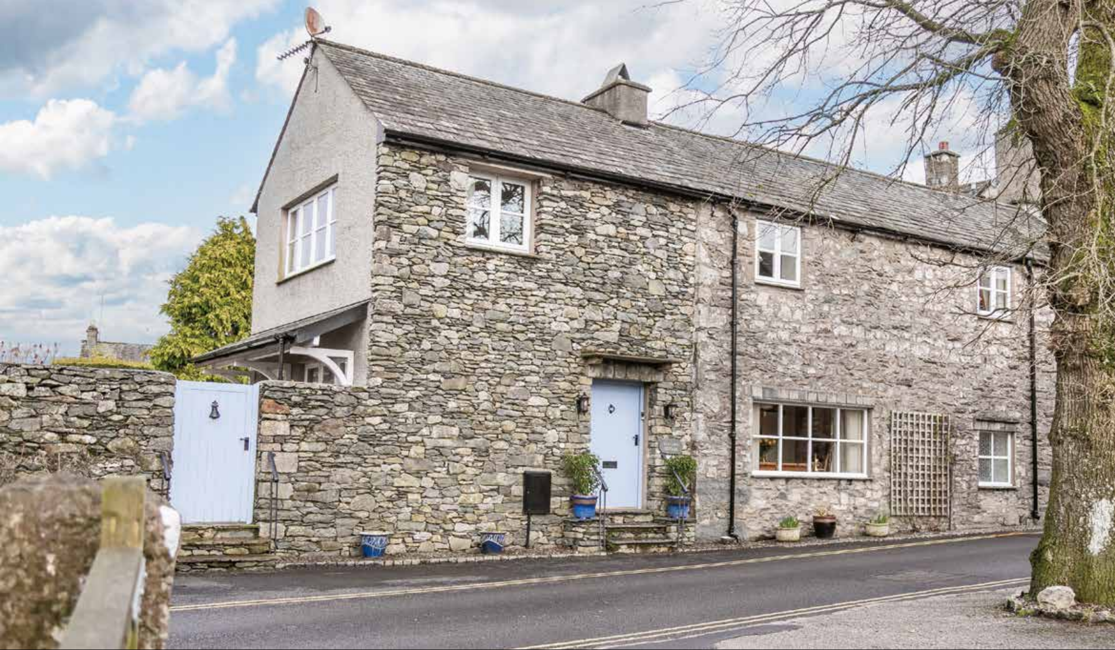
Parkgate Cottage The Square | Cartmel | The Lake District | LA11 6QB