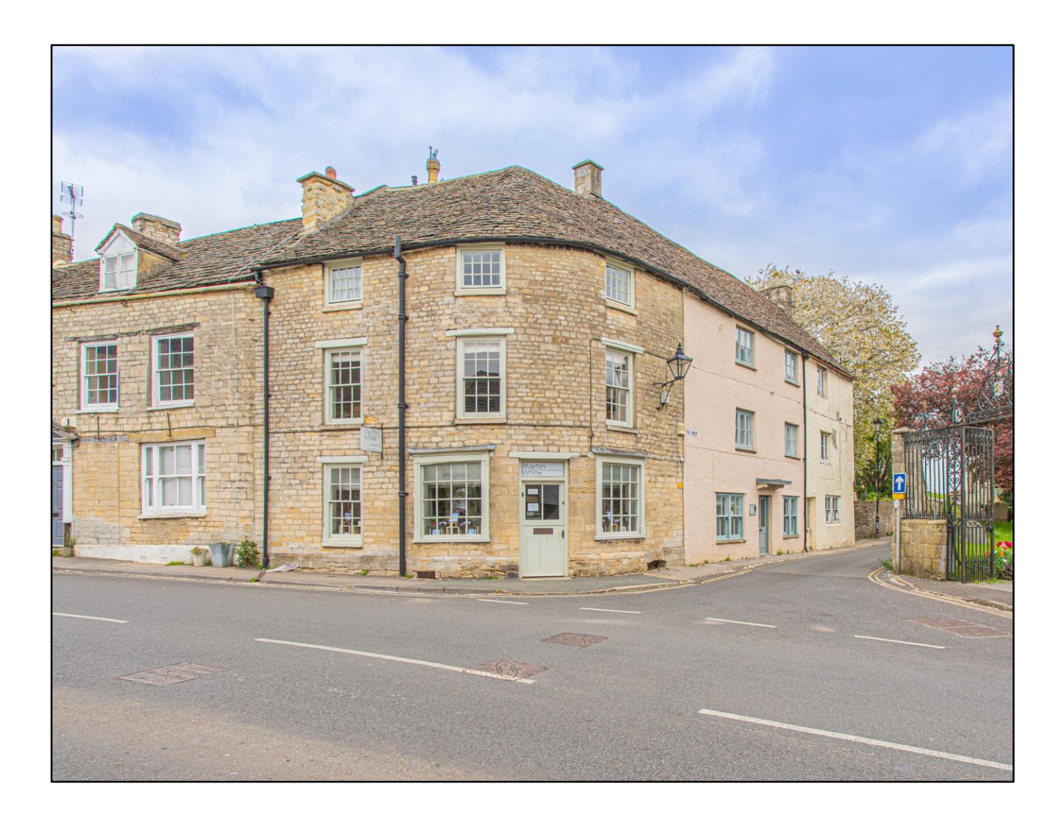
An eye-catching Grade II Listed commercial premises on Tetbury's sought after Church Street.