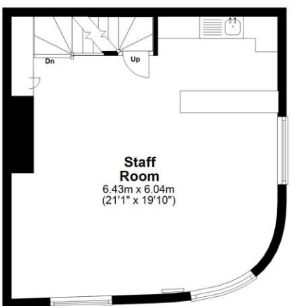
First Floor Approx. 35.4 sq. metres (381.5 sq. feet)