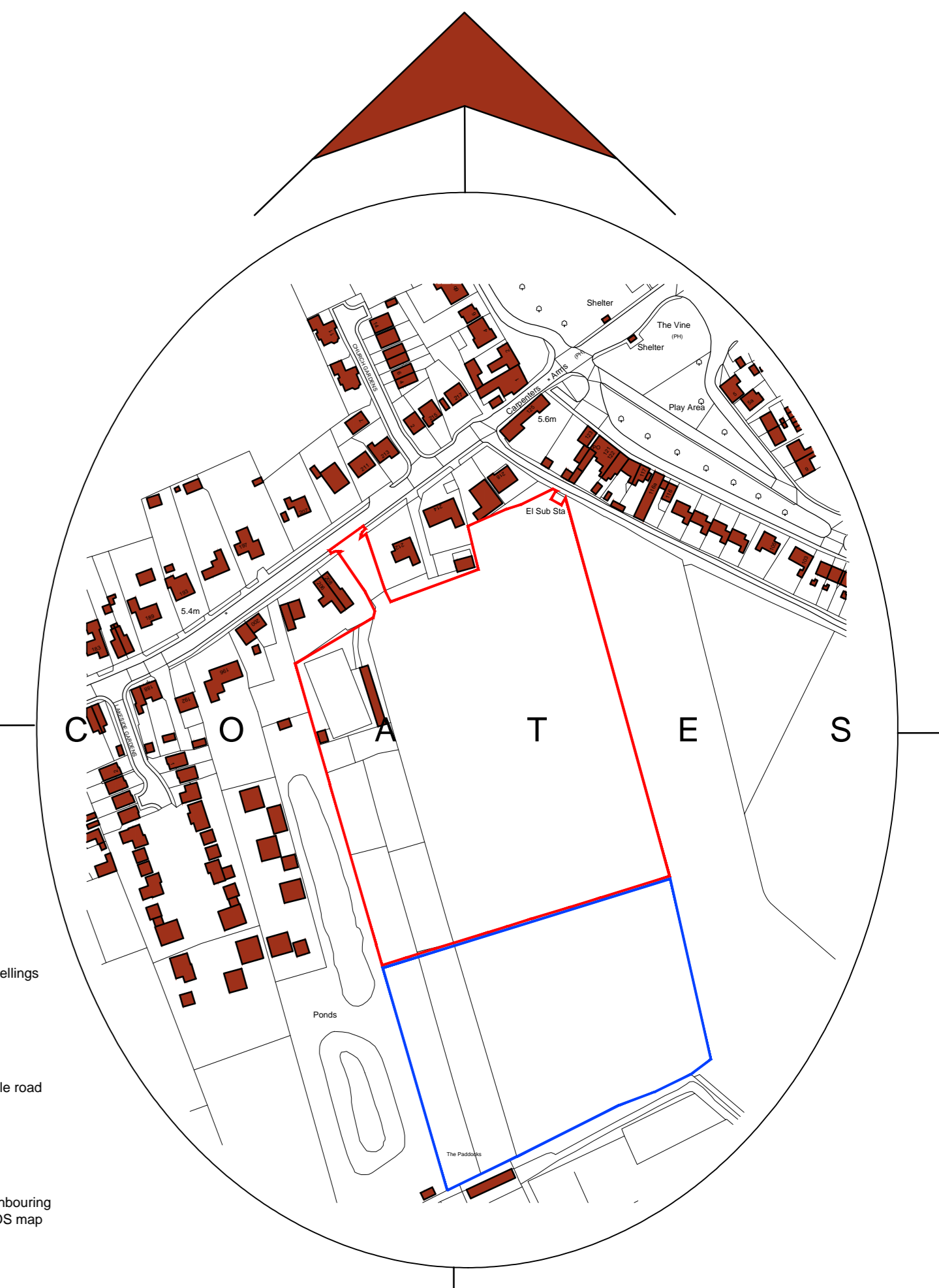
Location Plan Scale: 1:2500