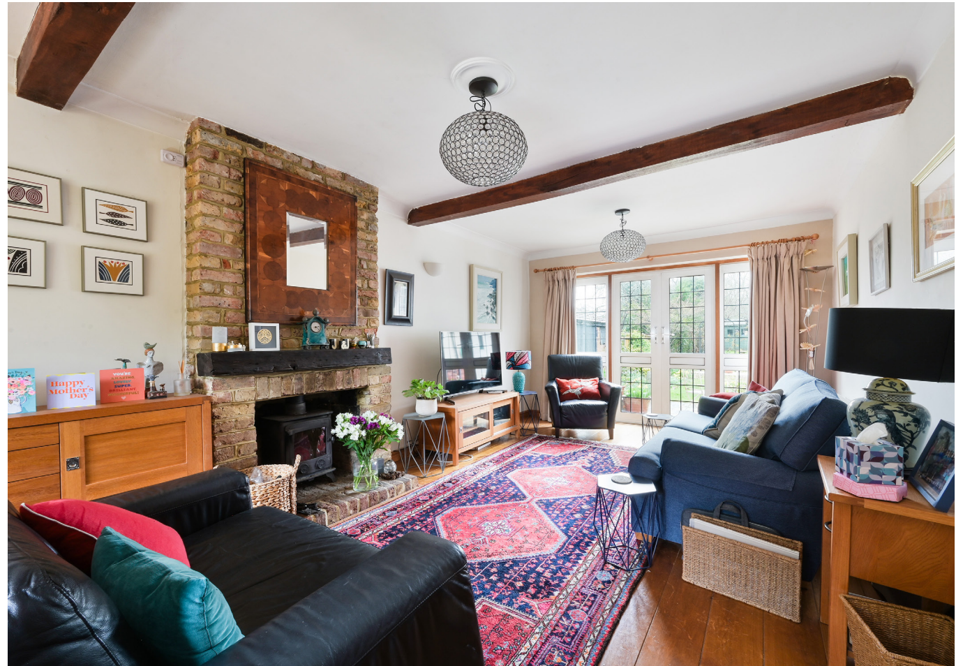
An attractive four bedroom semi detached property in a semi rural location yet close to Godstone train station and junction 6 of the M25.