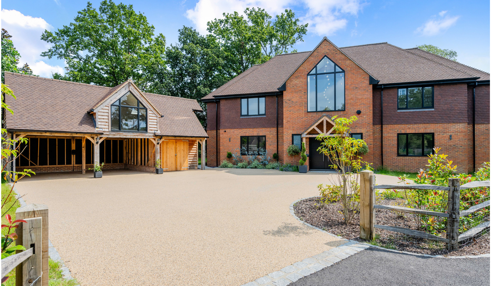
Felbridge, West Sussex