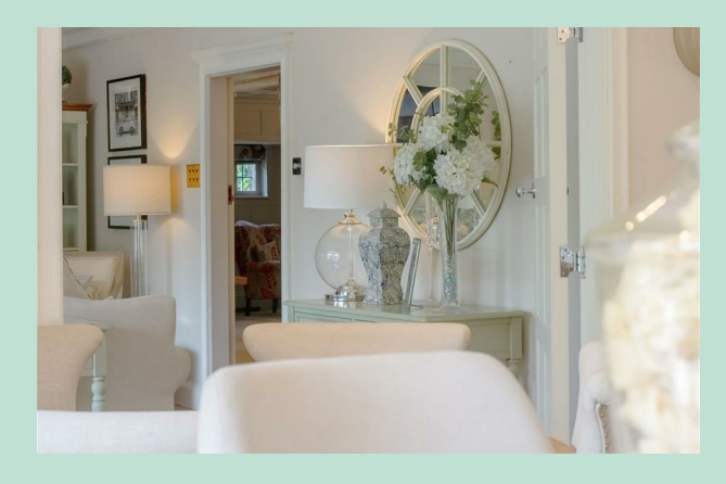
35, BRACEBRIDGE ROAD