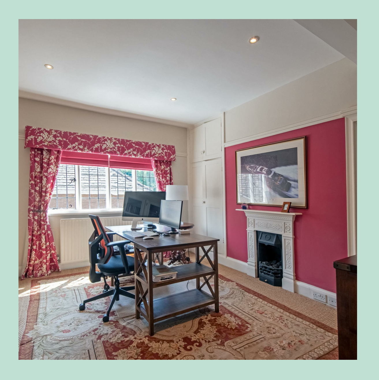
35, BRACEBRIDGE ROAD