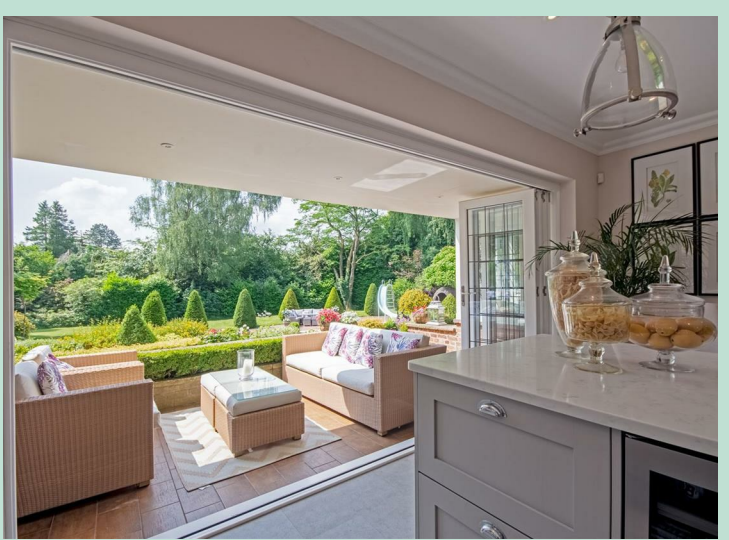
35, BRACEBRIDGE ROAD