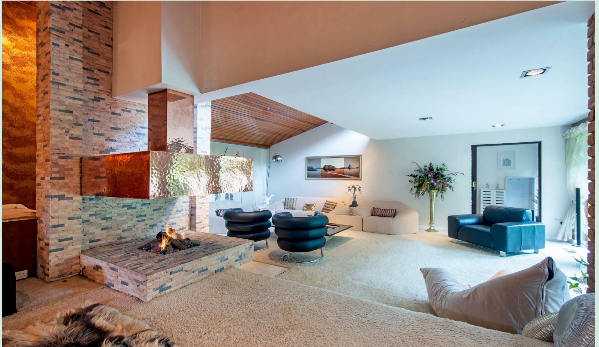
SUKHMANI, ENDWOOD DRIVE SUTTON COLDFIELD