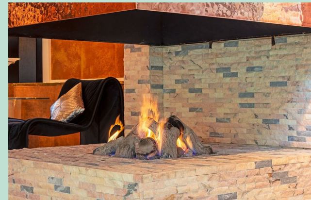
SUKHMANI, ENDWOOD DRIVE SUTTON COLDFIELD