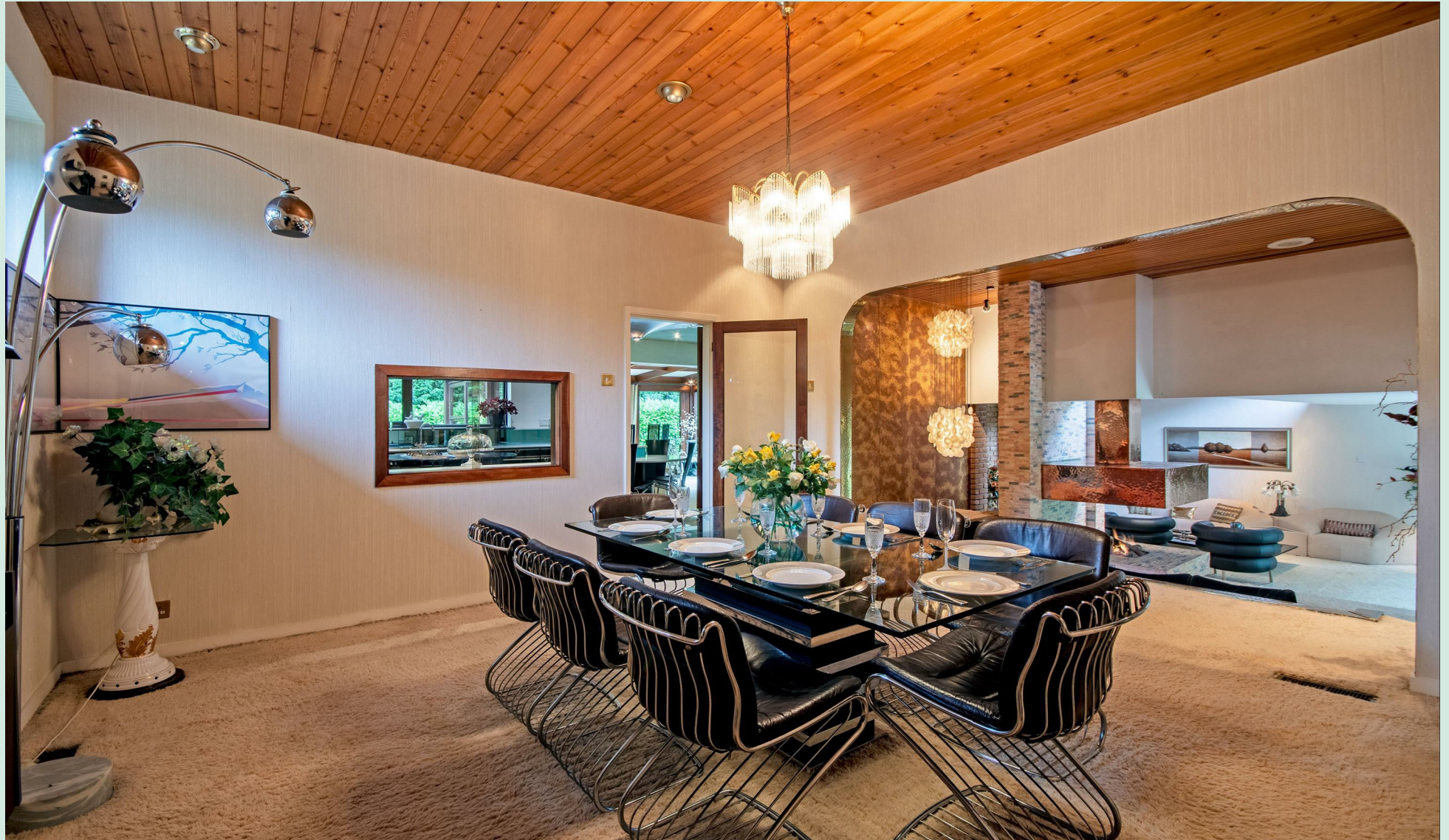
SUKHMANI, ENDWOOD DRIVE SUTTON COLDFIELD