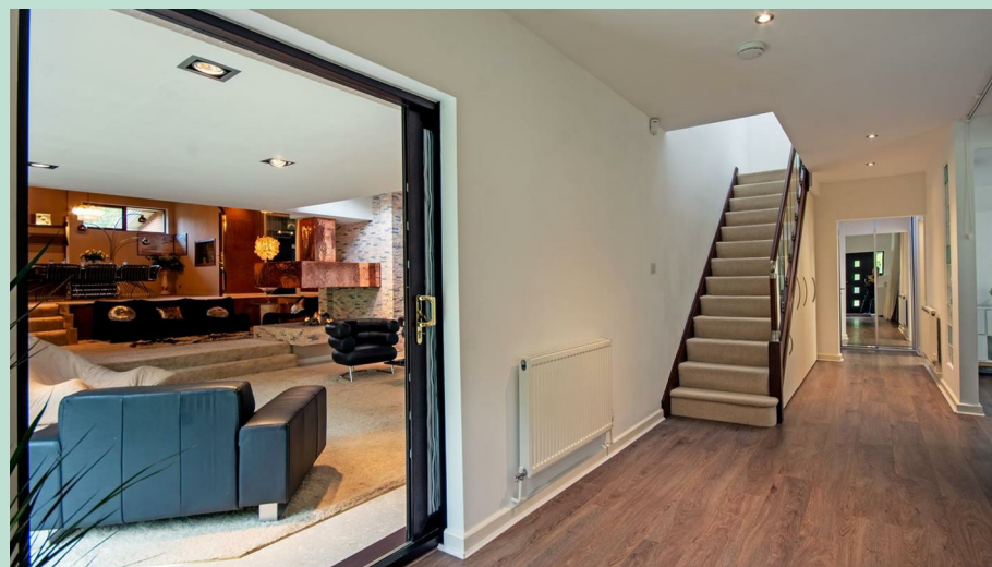
SUKHMANI, ENDWOOD DRIVE SUTTON COLDFIELD