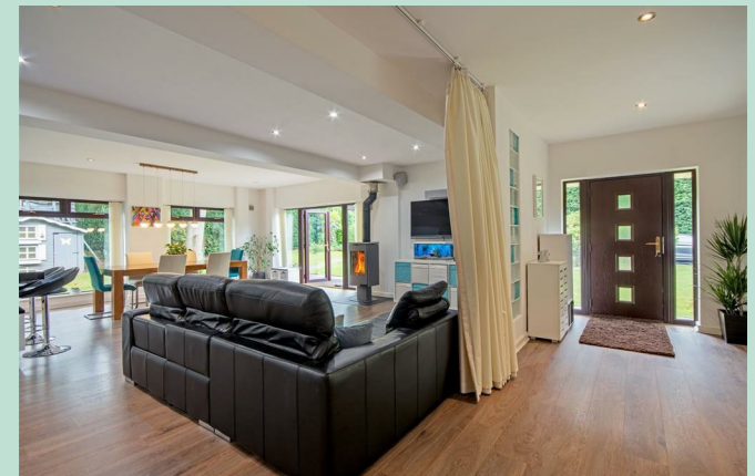
SUKHMANI, ENDWOOD DRIVE SUTTON COLDFIELD