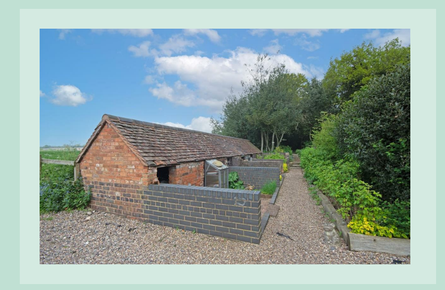
4 CHURCH ROW, COPPICE LANE MIDDLETON, TAMWORTH