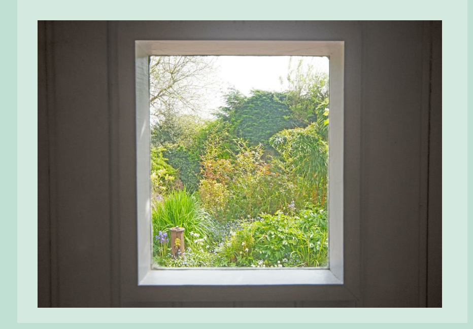
4 CHURCH ROW, COPPICE LANE MIDDLETON, TAMWORTH