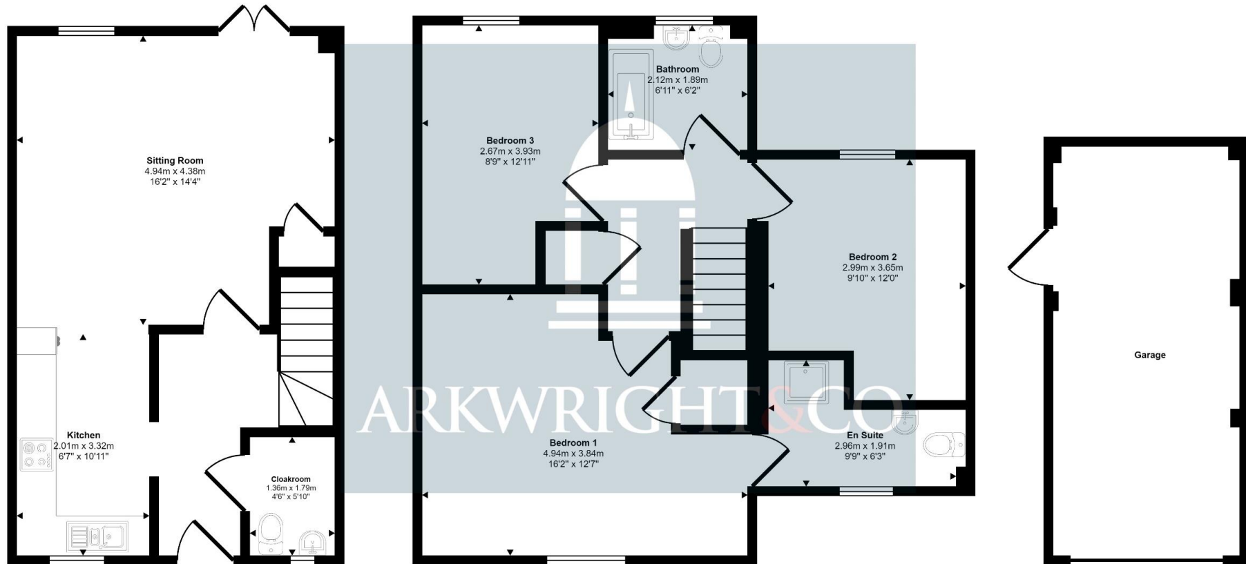
Ground Floor Approx 39 sq m / 417 sq ft

Approx Gross Internal Area 112 sq m / 1208 sq ft