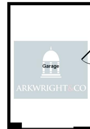
Garage Approx 22 sq m / 236 sq ft

Agents Notes: All measurements are approximate and quoted in metric with imperial equivalents and for general guidance only and whilst every attempt has been made to ensure accuracy, they must not be relied on. The fixtures, fittings and appliances referred to have not been tested and therefore no guarantee can be given that they are in working order. Internal photographs are reproduced for general information and it must not be inferred that any item shown is included with the property. For a free valuation, contact the numbers listed on the brochure.