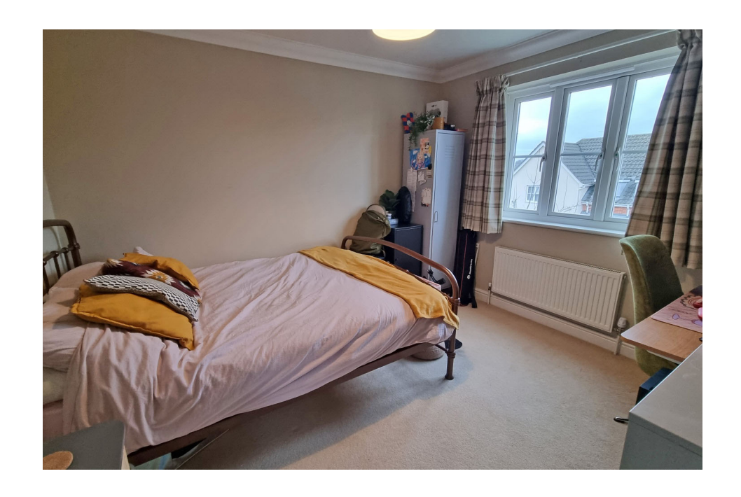
Bedroom Three 8'0 x 7'0 (2.44m x 2.13m) Window to side and wall-mounted radiator.

A double bedroom with window to side. Built-in double wardrobe with hanging rail and shelving. Access to loft.