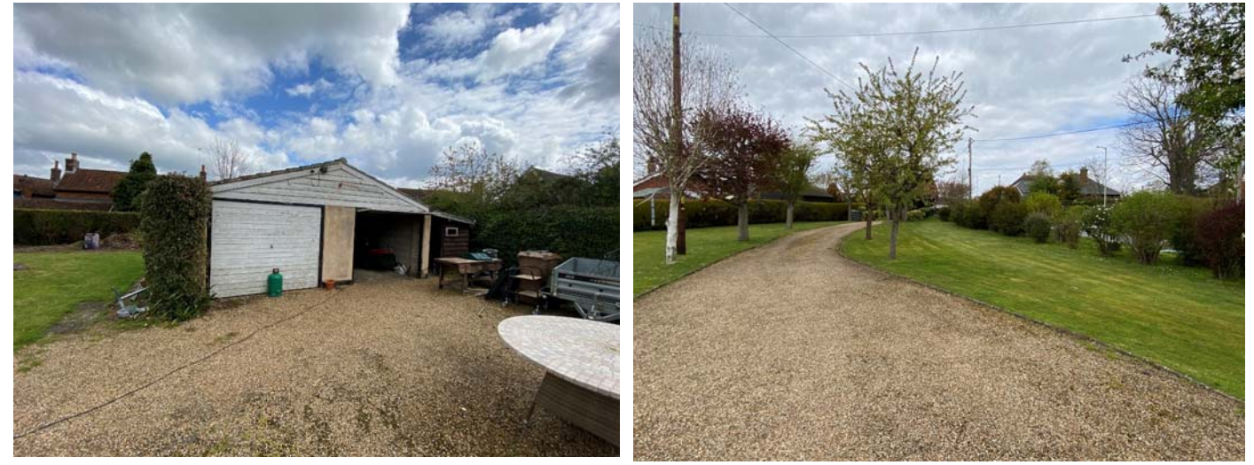
Driveway leading to plot-not part of site area being offered for sale