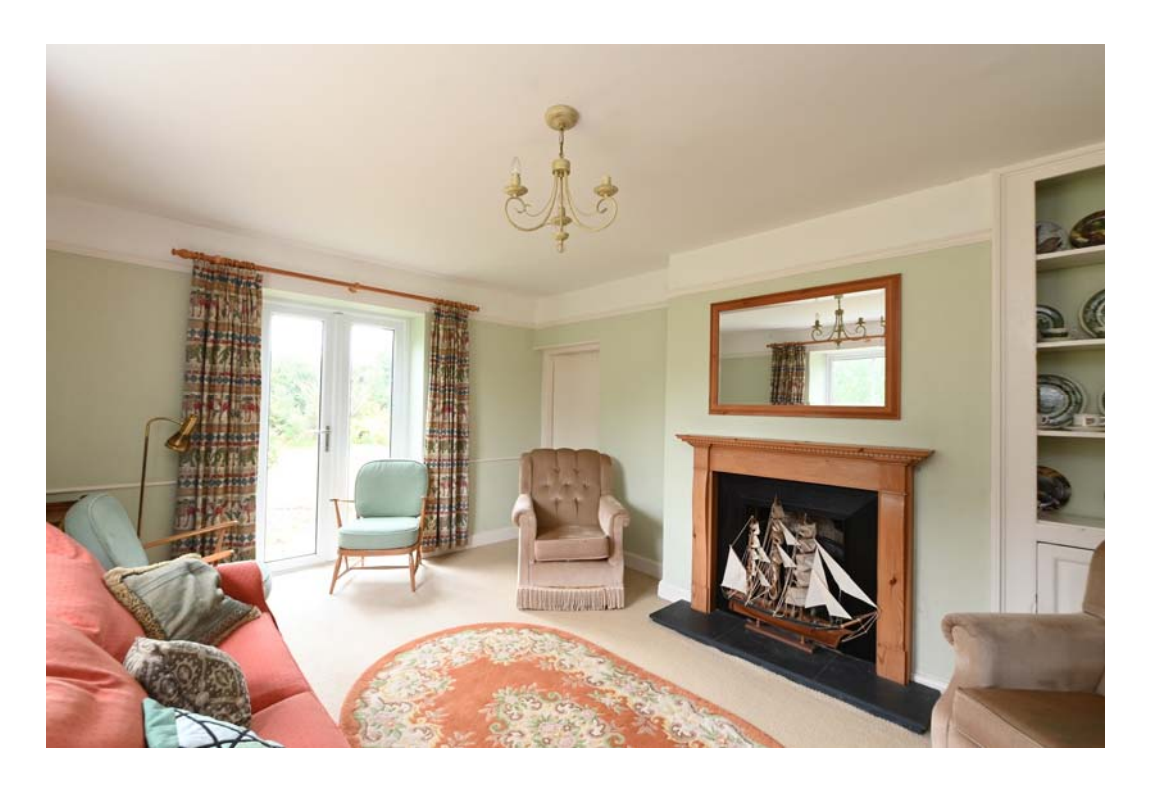
Snug 15' x 12' (4.57m x 3.66m)

A pleasant dual aspect room with east facing window and south facing French doors opening to the garden. Fireplace with timber surround and flanked on one side by a fitted display cabinet with shelving. Radiator. A door leads to the