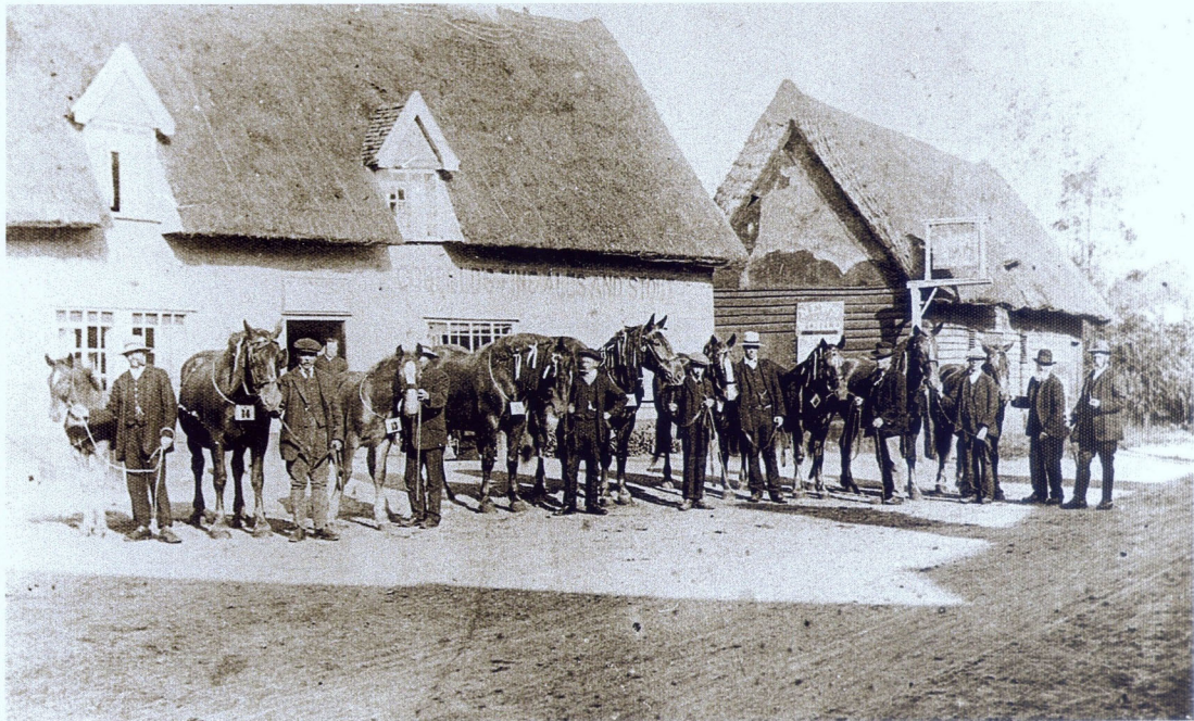
Queens Head 1910