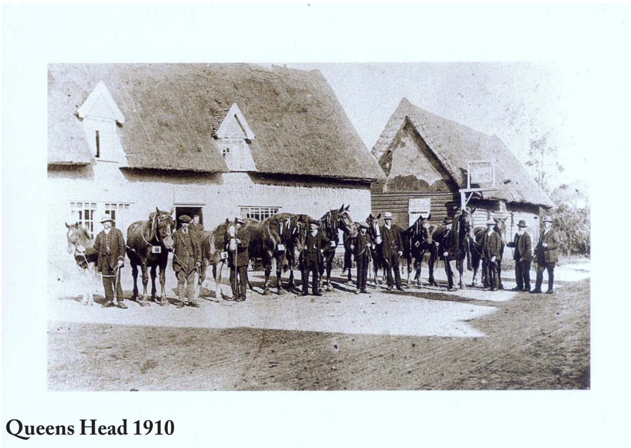
Queens Head 1910