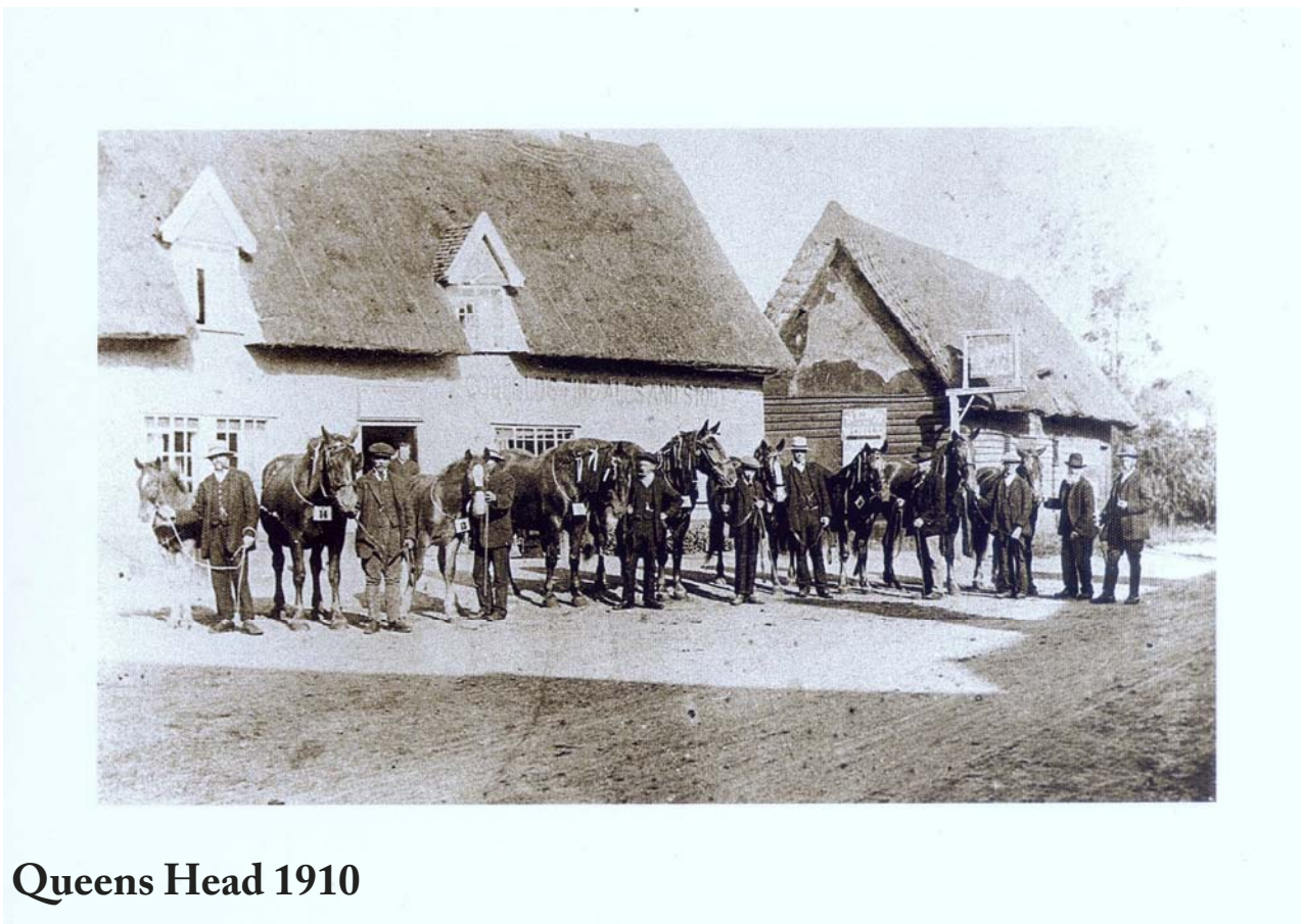
Queens Head 1910