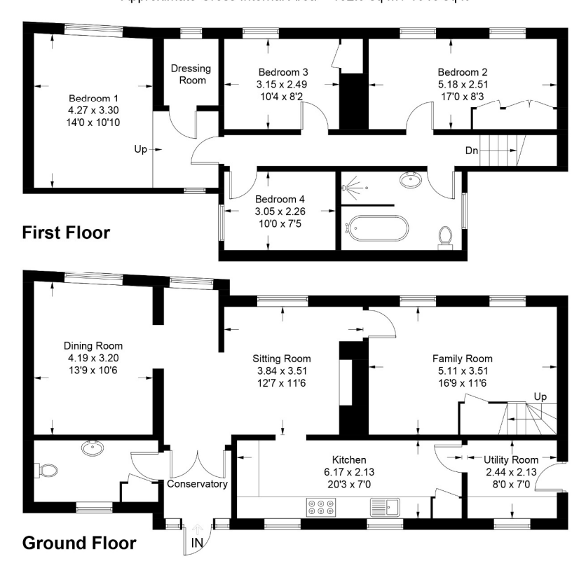
For identification purposes only. Not to scale. Copyright fullaspect.co.uk Produced for Clarke and Simpson

Approximate Gross Internal Area = 152.9 sq m / 1646 sq ft