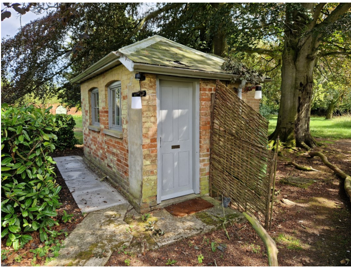
Shared WC facility