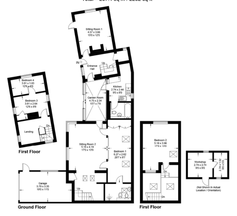
For identification purposes only. Not to scale. Copyright fullaspect.co.uk Produced for Clarke and Simpson

Viewing Strictly by appointment with the agent.