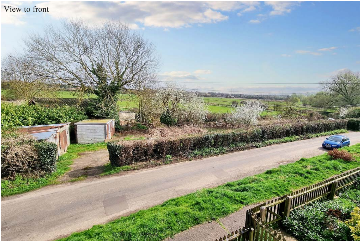
View to front

For those using the What3Words app: ///revolts.animator.landlady