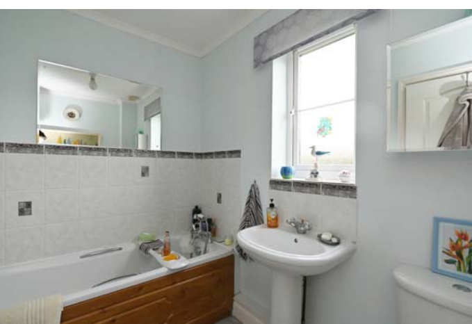
A door from the entrance hall opens to