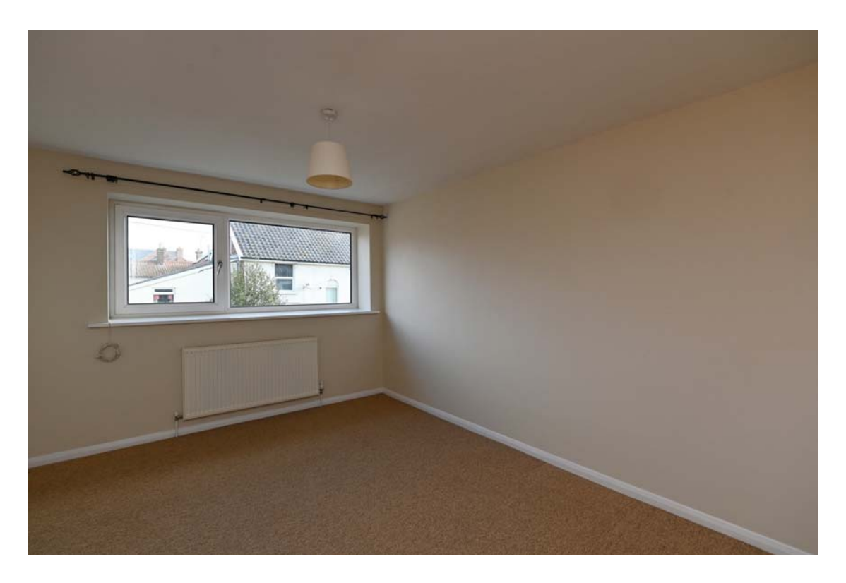
Bedroom Two 13'5 x 9'1 (4.09m x 2.77m) Double bedroom with window to front. Wall-mounted radiator.

Double bedroom with window to front. Wall-mounted radiator.