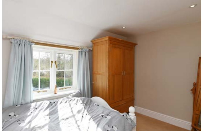
Bedroom Six 15' 8'5 (4.57m 2.57m)

North facing window with lovely views. Recessed spotlighting. Radiator. Wall to wall fitted wardrobes. Radiators. A door opens to an en-suite.