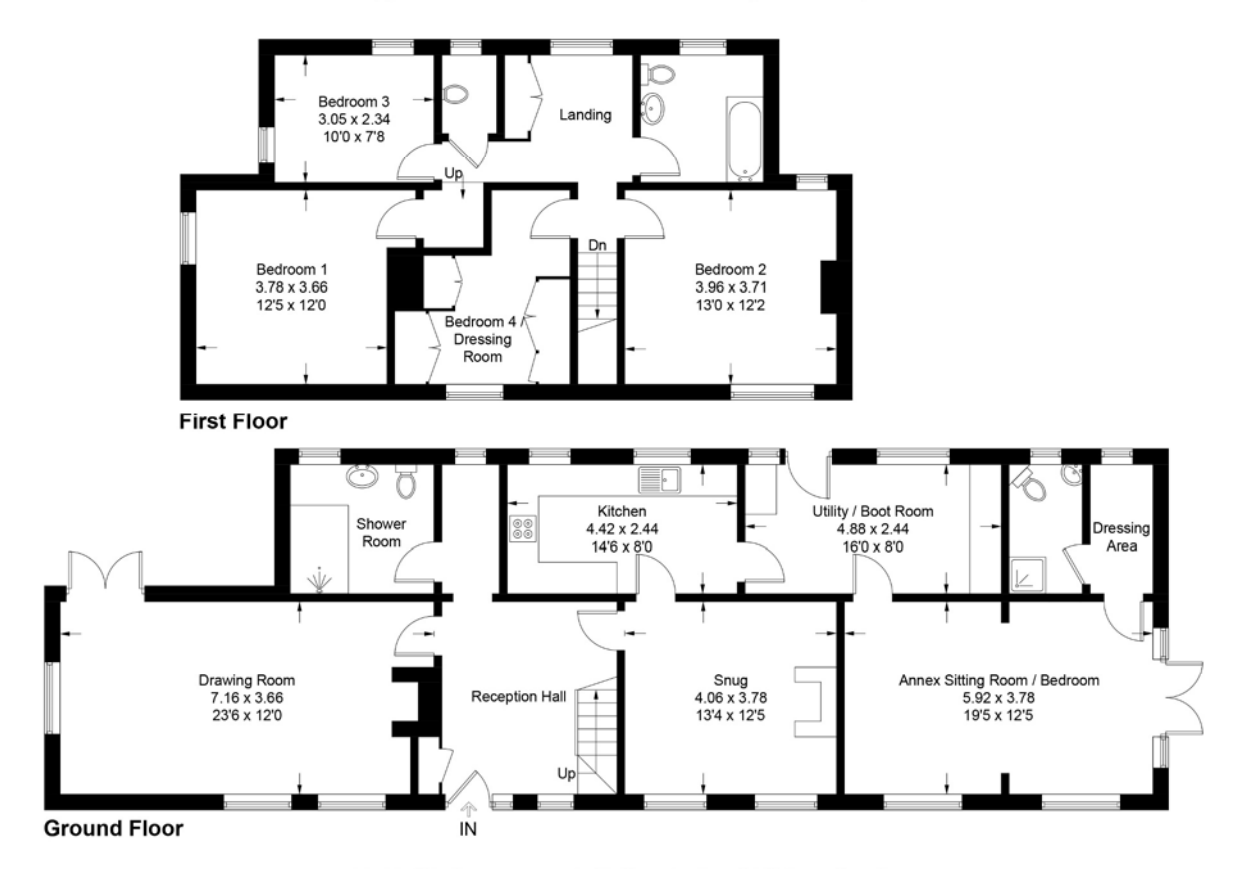
For identification purposes only. Not to scale. Copyright fullaspect.co.uk Produced for Clarke and Simpson