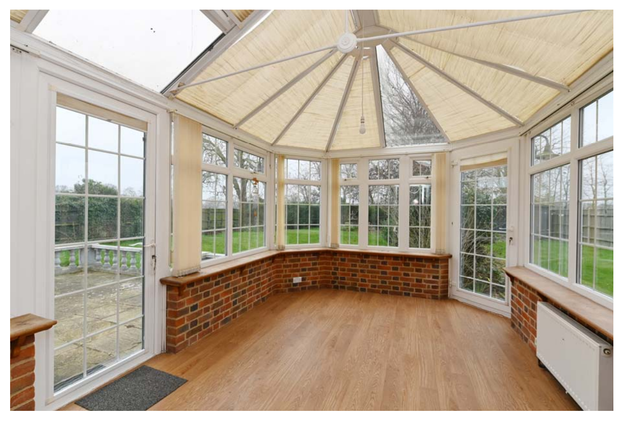
Returning to the Entrance Hall, a glazed door opens into the

A delightful addition to the house, and providing good views of the rear garden. Of UPVC construction with a pitched glazed roof set on a raised brick plinth. Wood effect flooring, radiators and doors providing access to the garden.