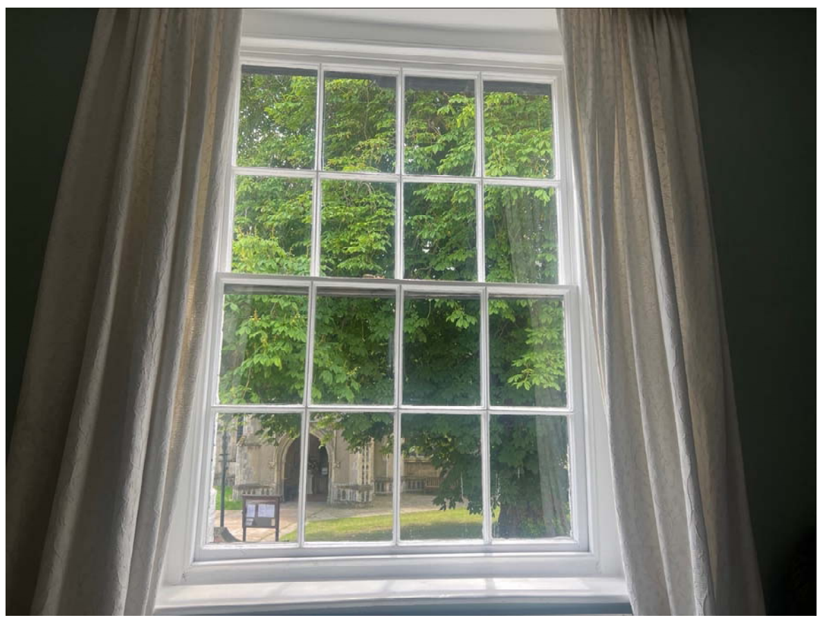
View from Bedroom One to St Mary's Church