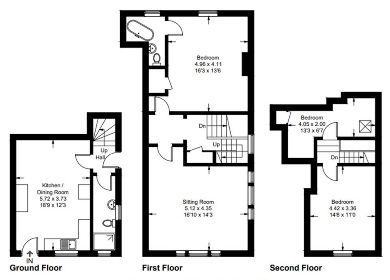
Illustration for identification purposes only, measurements are approximate, not to scale. floorplansUsketch.com © (ID1083414)