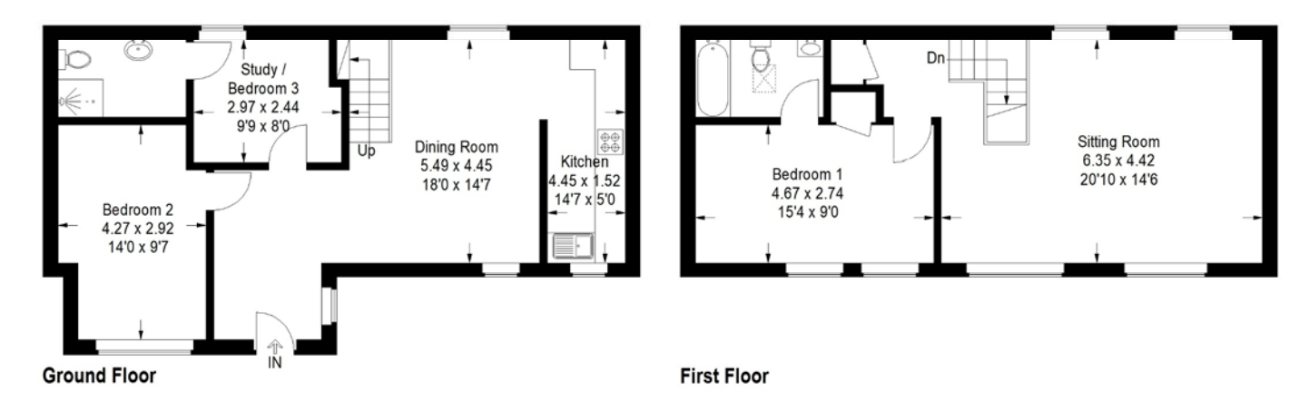
For identification purposes only. Not to scale. Produced for Clarke and Simpson

Viewing Strictly by appointment with the agent.