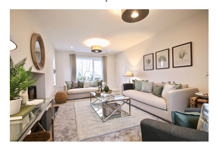
Example Interiors from Landex New Homes - illustrative only