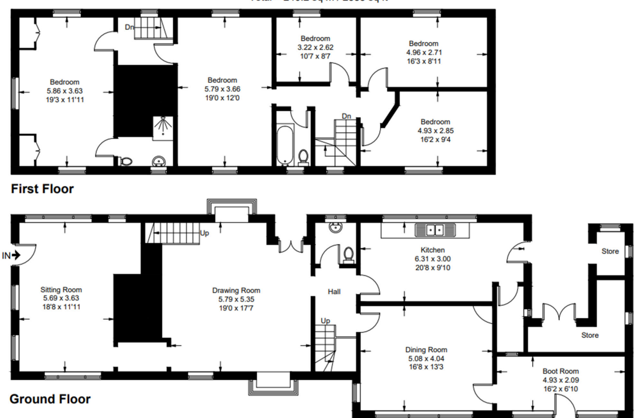
Illustration for identification purposes only, measurements are approximate, not to scale. Fourlabs.co © (ID1128848)

Uplands House, Clopton Approximate Gross Internal Area = 232.2 sq m / 2499 sq ft Stores = 8.0 sq m / 86 sq ft Total = 240.2 sq m / 2585 sq ft