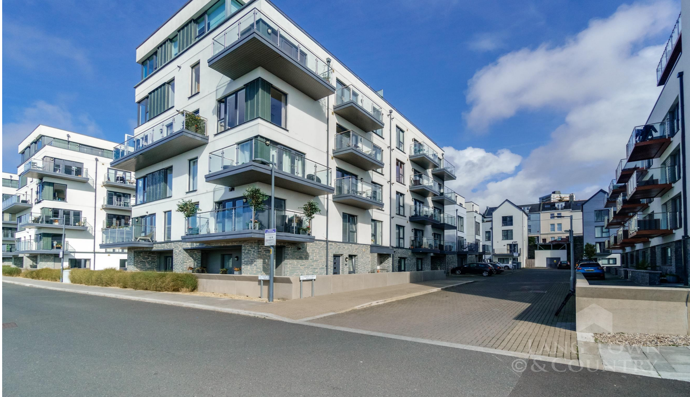
Apartment 9 Trinity Street, West Hoe, Plymouth, Devon, PL1 3FT