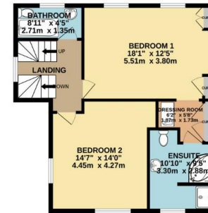
1ST FLOOR 660 sq.ft. (61.3 sq.m.) approx.