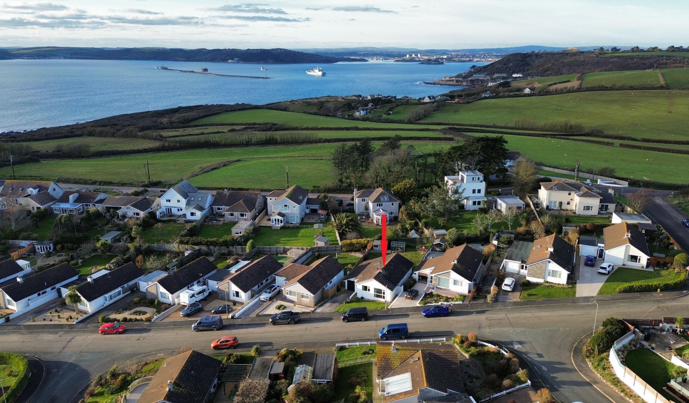
8 Westlake Rise, Heybrook Bay, Plymouth, Devon, PL9 0DS