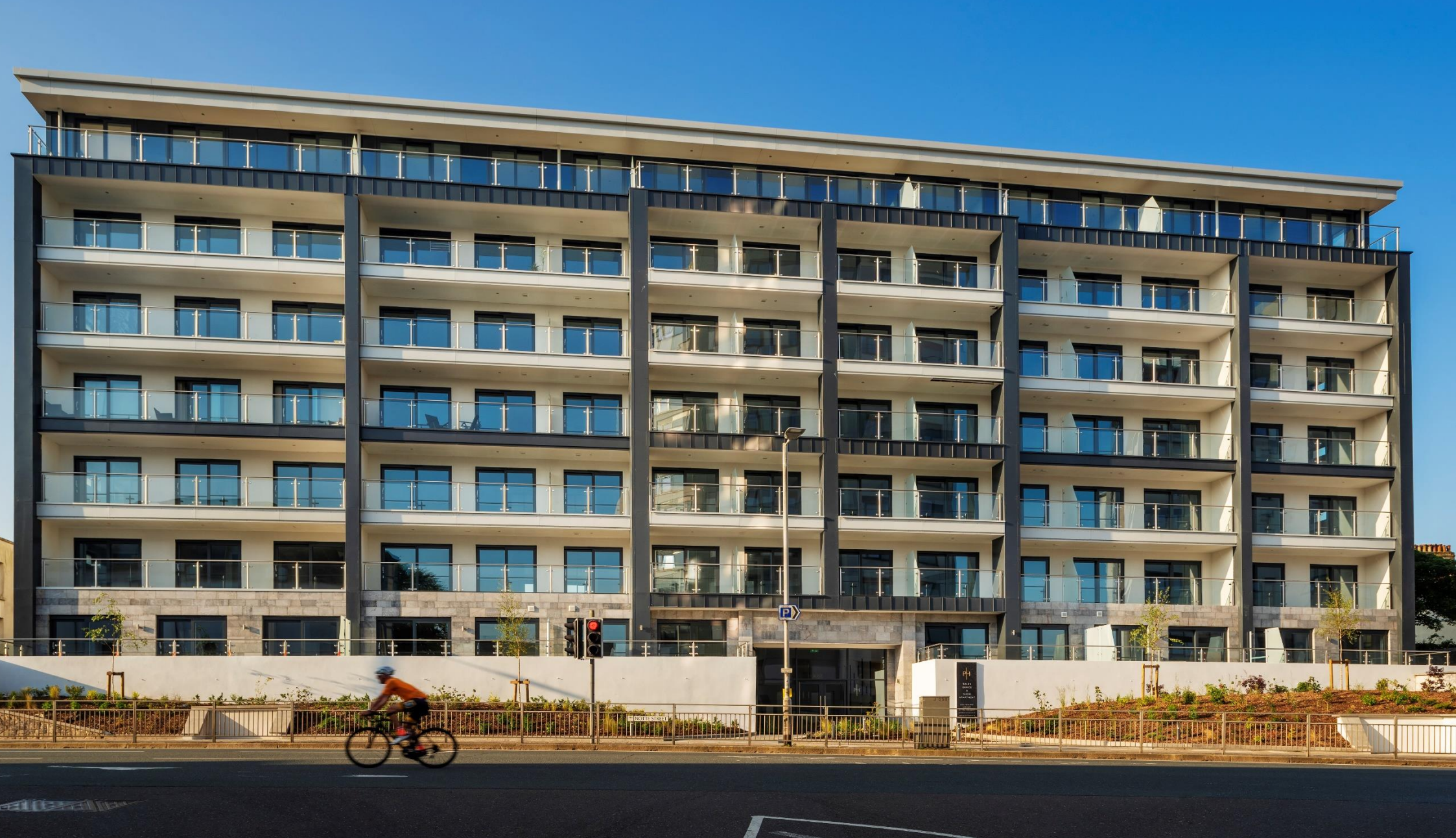
Peirson House, Apartment 36, 175 Notte Street, The Hoe, Plymouth, PL1 2RW