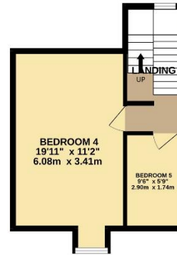
2ND FLOOR 331 sq.ft. (30.8 sq.m.) approx.