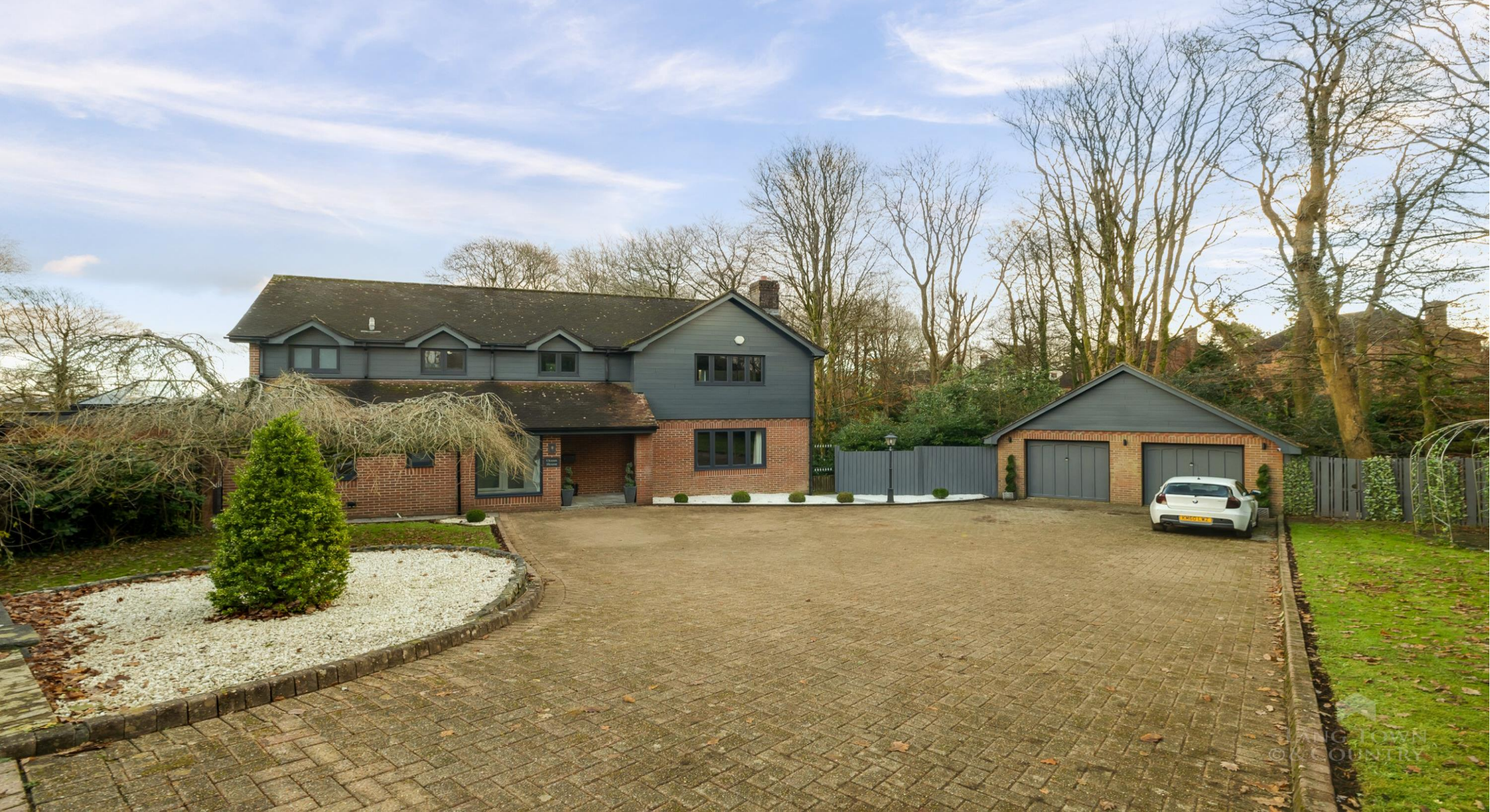
Ocean House, 4 Woodlands End, Glenholt, Plymouth, Devon, PL6 7RE