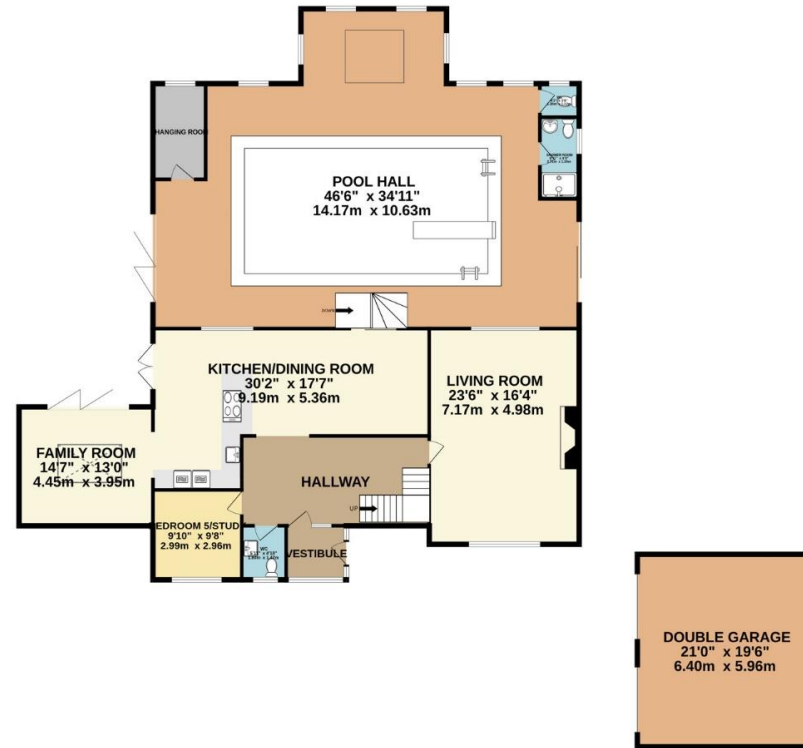
GROUND FLOOR 3117 sq.ft. (289.6 sq.m.) approx.