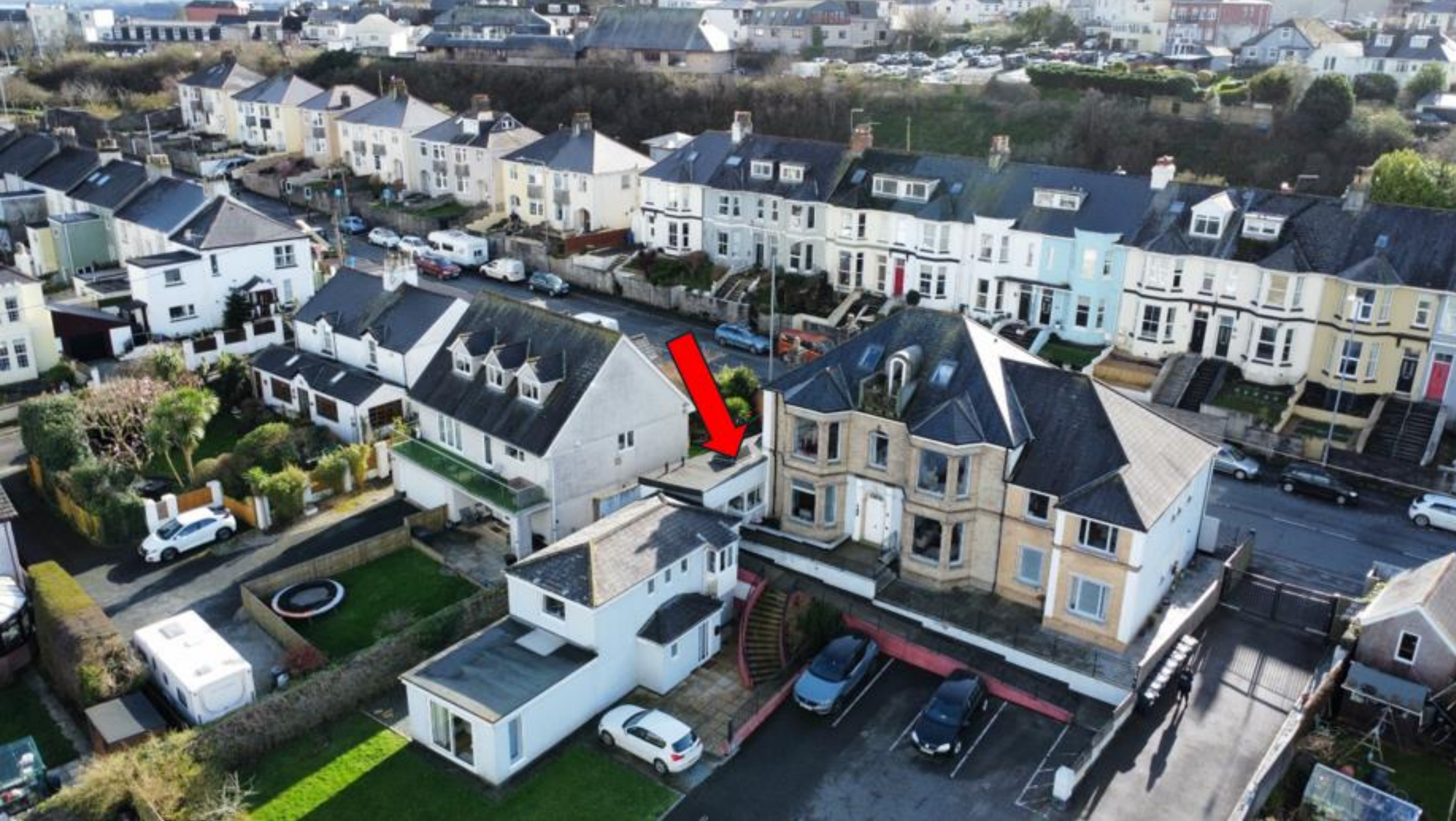
Apartment 3, Boisdale House, 78, North Road, Saltash, Cornwall, PL12 6BE