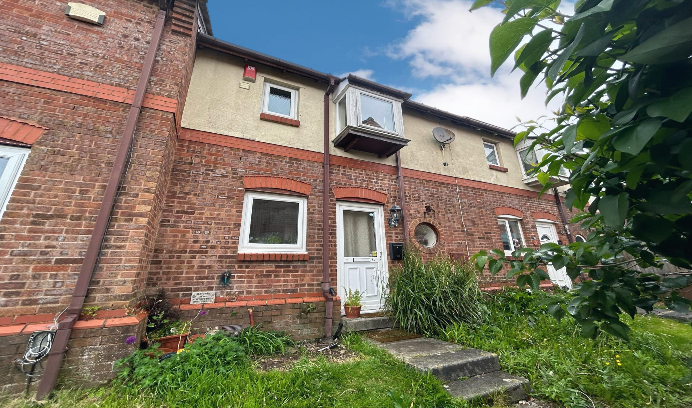
Chesterton Close, Crownhill, Plymouth