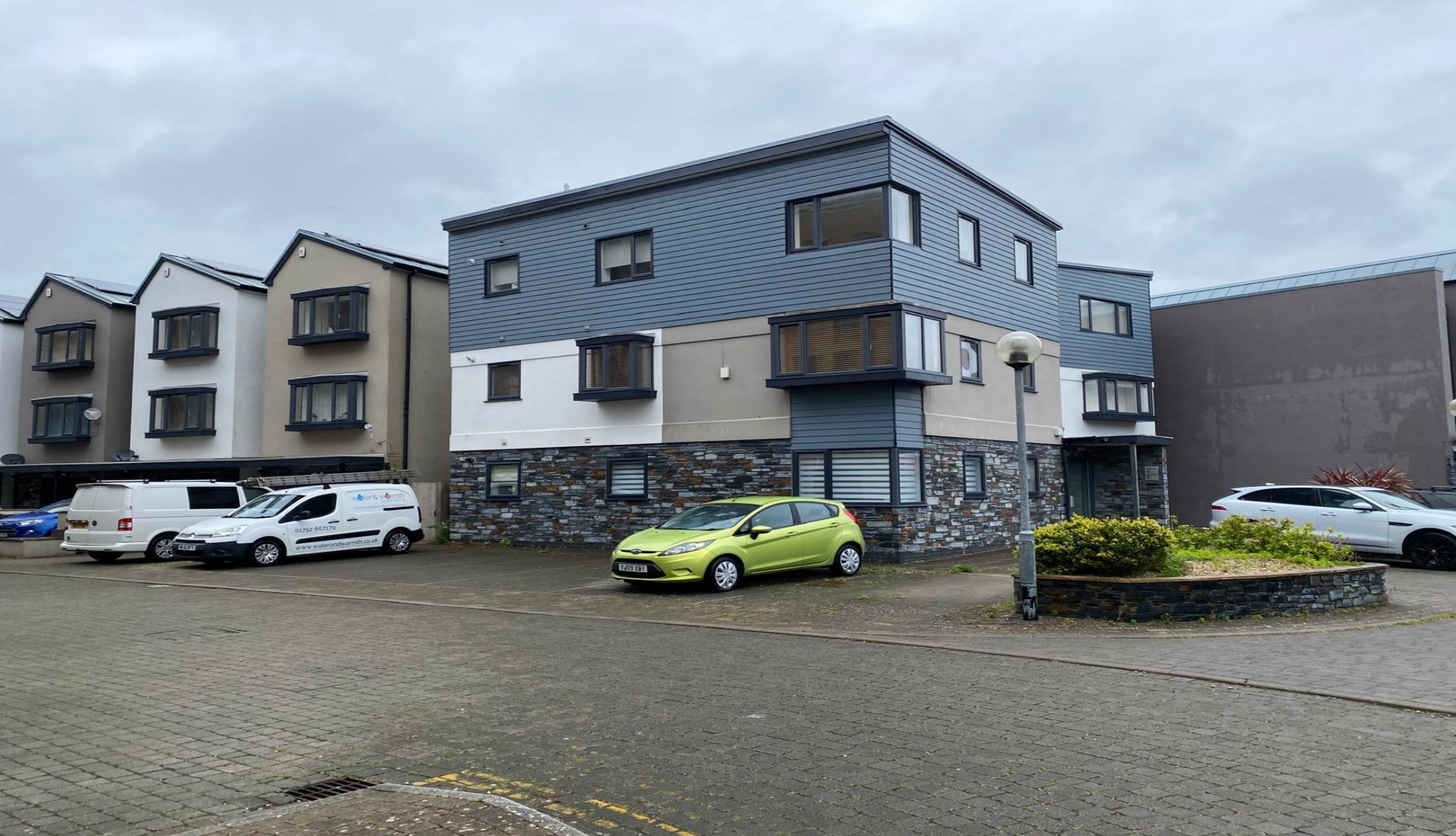
Flat 6 Queen Annes Quay, 22 Parsonage Way, Coxside, Plymouth, Devon, PL4 0LY