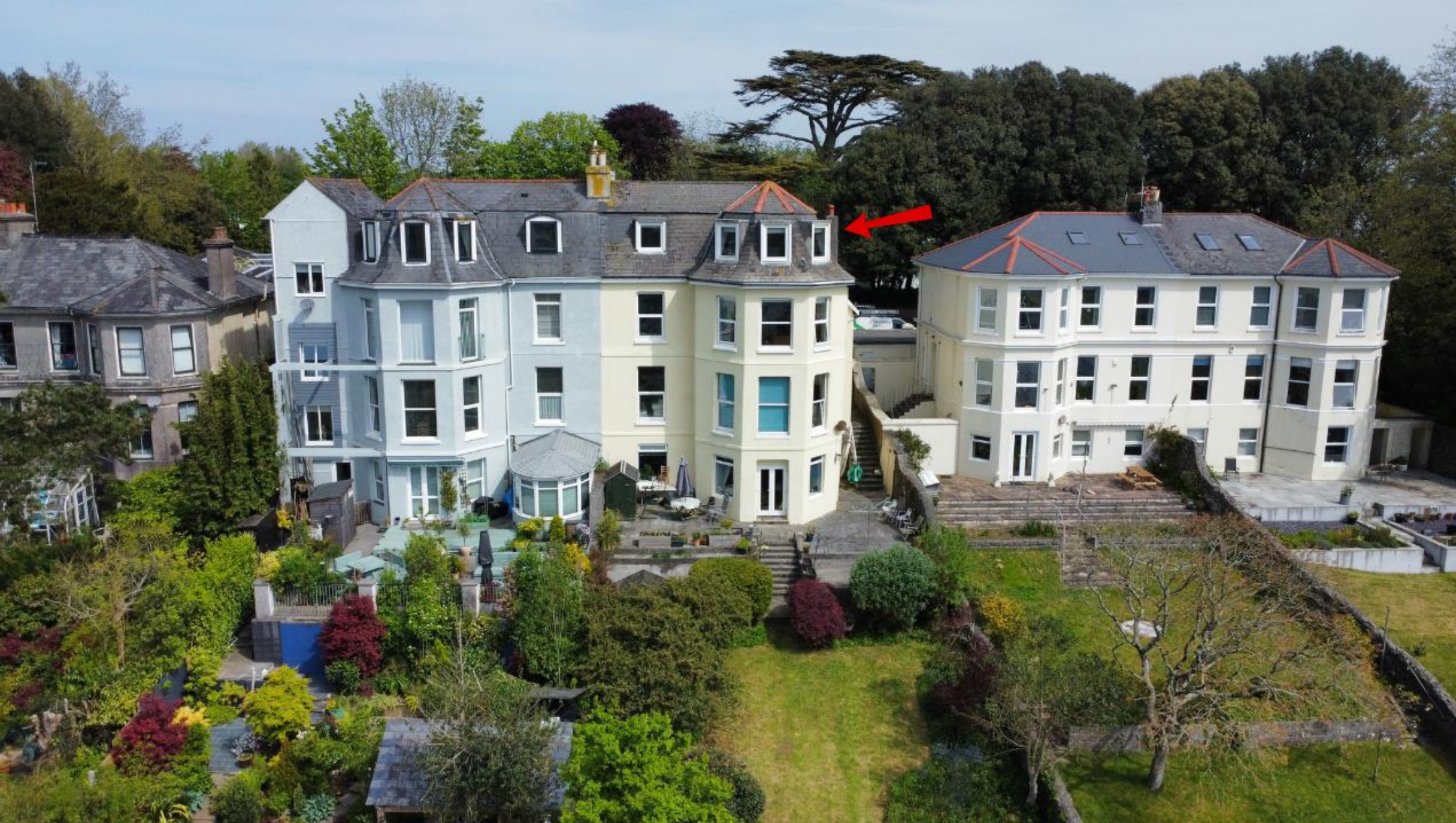
Hartley Avenue, Plymouth, Devon