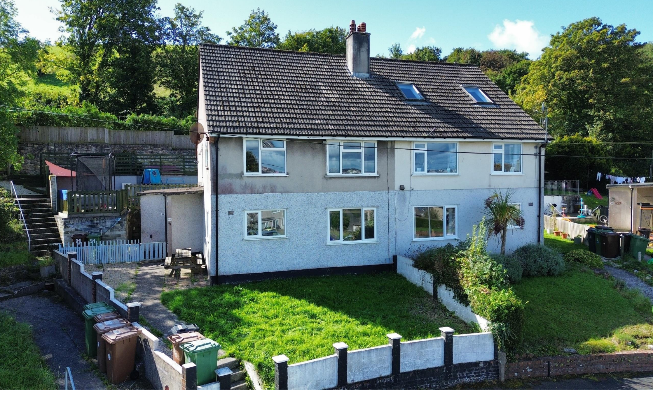
89 South Hill, Hooe, Plymouth, Devon, PL9 9PT