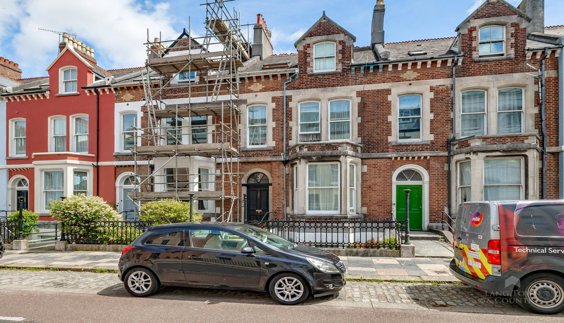
Garden Flat 121, Durnford Street, Stonehouse, Plymouth, Devon, PL1 3QP