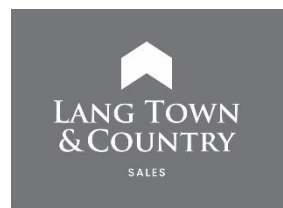
Highfield Cottage, Fore Street, Holbeton, Plymouth, Devon, PL8 1NE