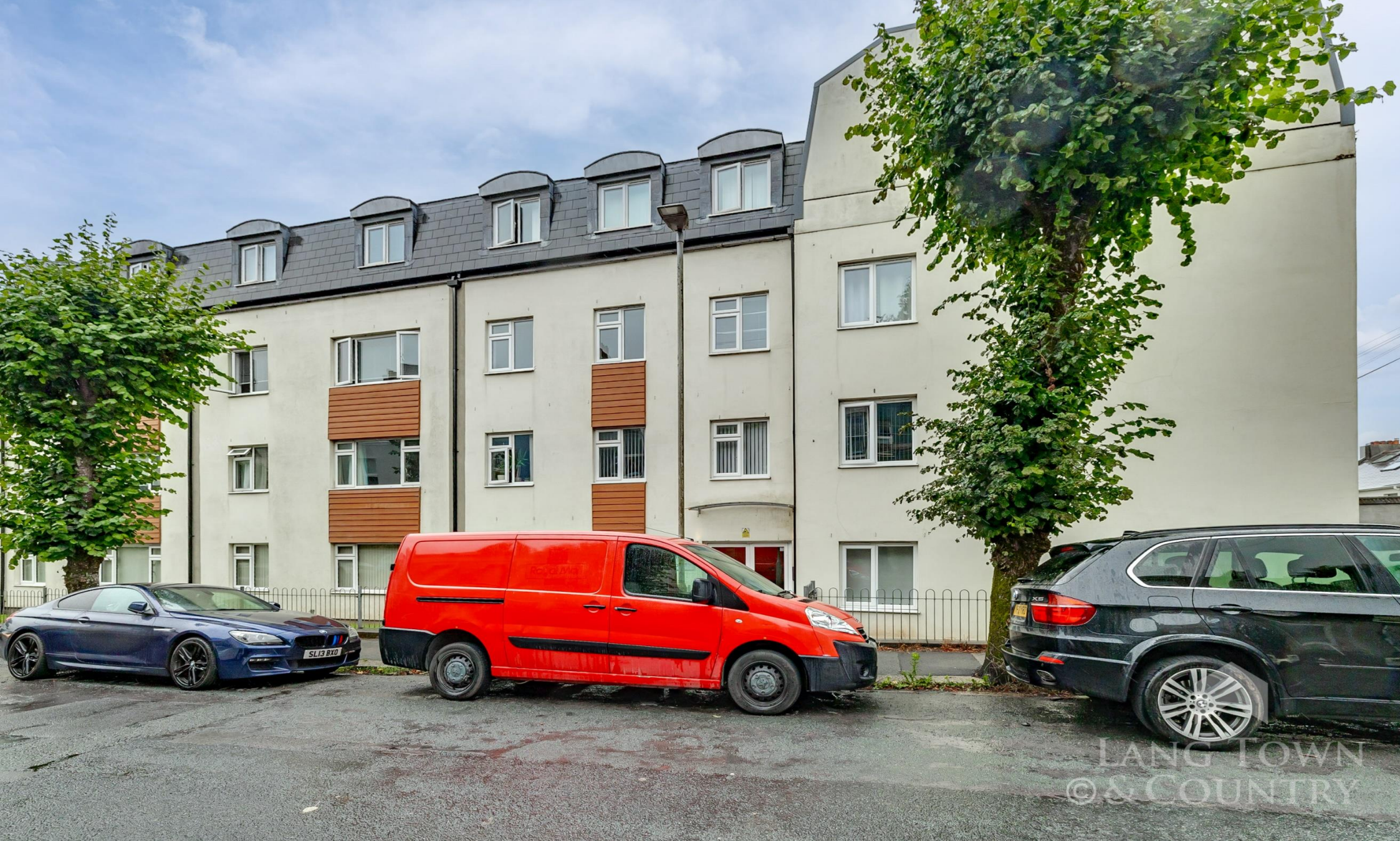
Flat 22, 23 Victoria Place, Stoke, Plymouth, Devon, PL2 1BY