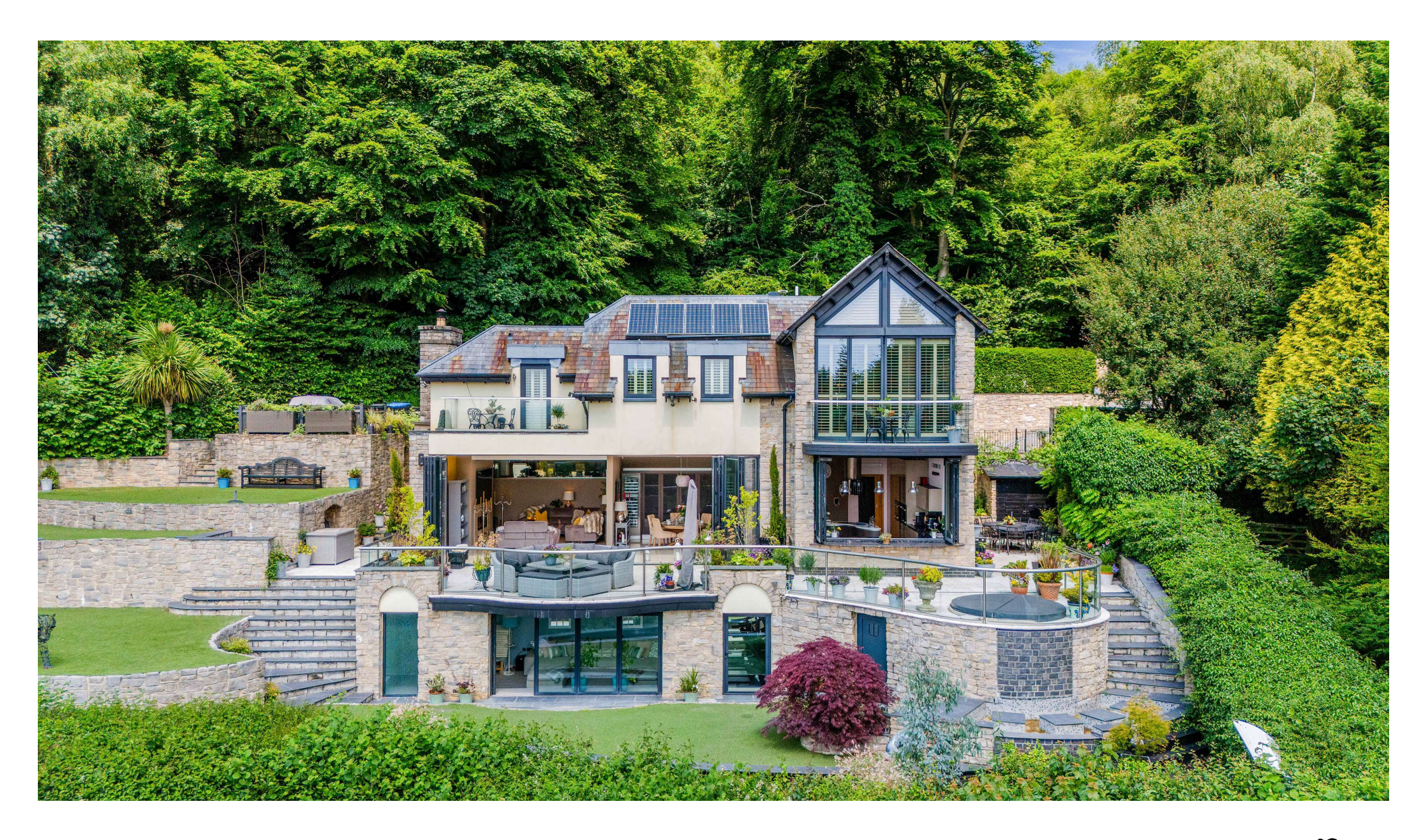
The Springs, Trevereux Hill, Oxted RH8 £2,895,000 Guide Price