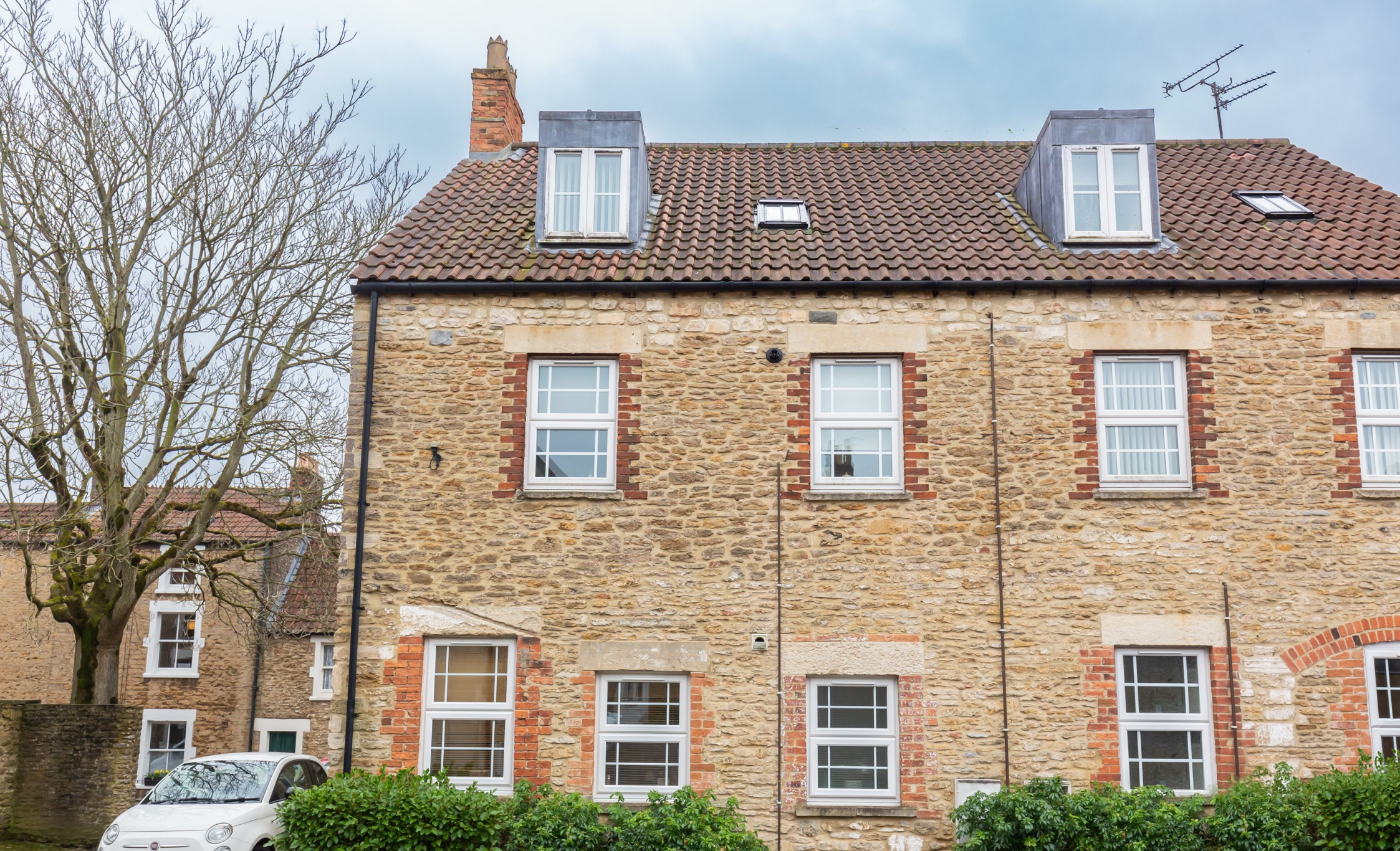
Naishs Street, Frome