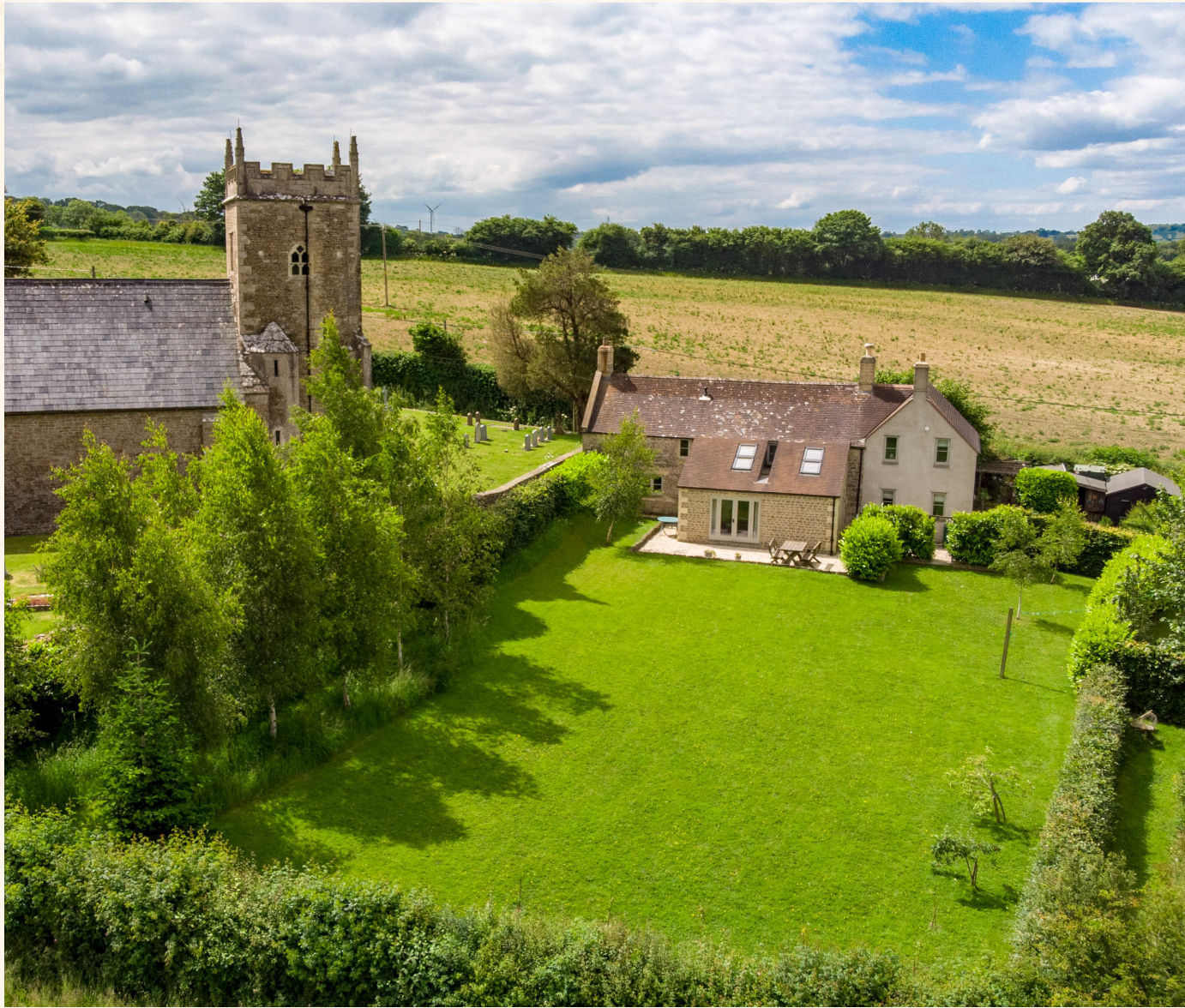
Church Cottage Cloford