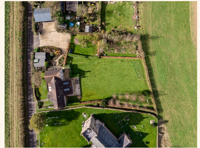
Church Cottage from above