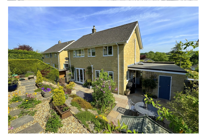
Tenure: Freehold Council Tax Band: 'F' £3,121.90pa