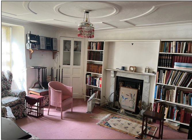
Trefa living room

Both Trefa and Tremel now require an extensive course of updating throughout and post works would make a fabulous family home with an annexe attached, or some may see the potential for two lucrative holiday lets.