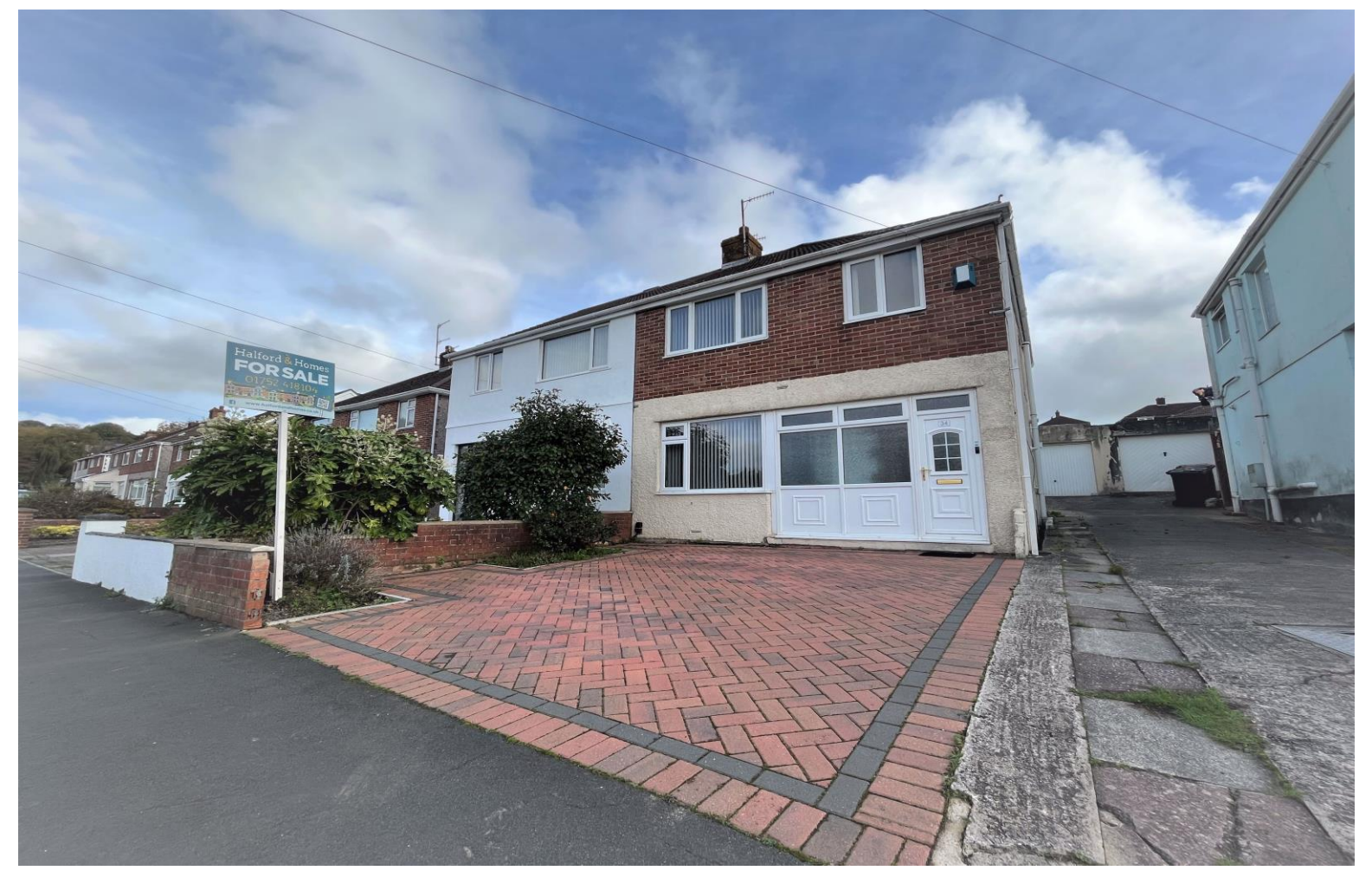
Larkham Lane, Plymouth, Devon, PL7 4PJ

Three Bedroom Semi Detached Stanbury Home